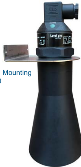
316 SS Mounting Bracket