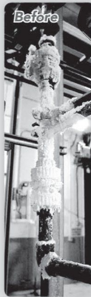
Leaking sodium hypochlorite in a welded PVC system

All Chemline valves 1/2" to 1" with True Union ends are available with ChemFlare™ ends