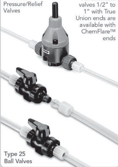
SB12 Back Pressure/Relief Valves

All Chemline valves 1/2" to 1" with True Union ends are available with ChemFlare™ ends