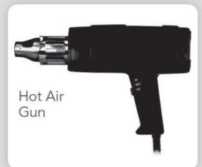
Hot Air Gun