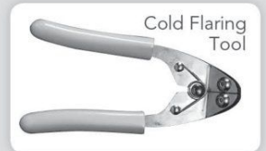
Cold Flaring Tool