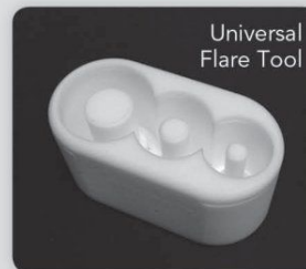
Universal Flare Tool