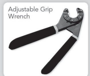
Adjustable Grip Wrench