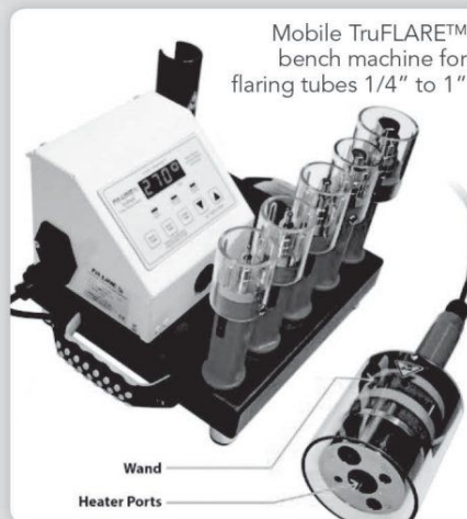
Mobile TruFLARE™ bench machine for flaring tubes 1/4" to 1"