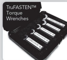
TruFASTEN™ Torque Wrenches