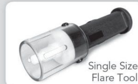
Single Size Flare Tool