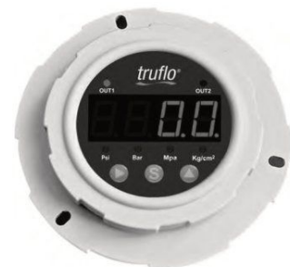
OBS-P Panel Mount