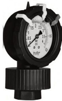
OBS Single side