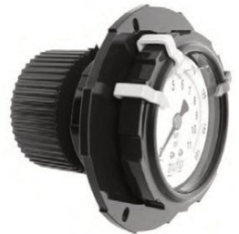
OBS-A Panel Mount