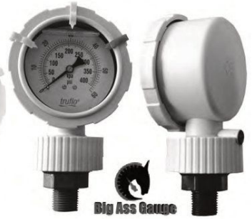
BAG Extra Large 3" Dial