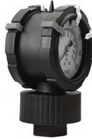
2VU Double Sided Display