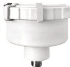
OBS-GO-C Center Mount