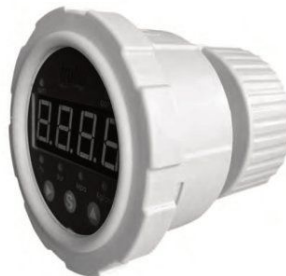
OBS-C Center Mount