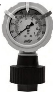
OBS-R 360° Rotator