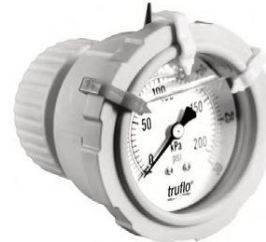
OBS-B Center Mount