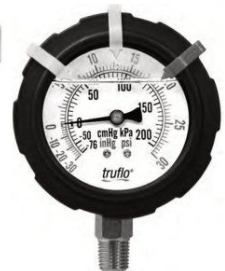
OBS-V Compound Vacuum -30 + 30 PSI Range