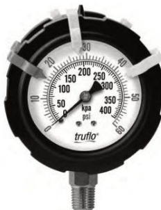
OBS-DGO Double Sided