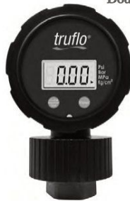
OBS-LC LCD Battery Operated